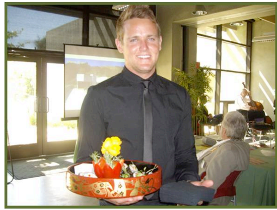
Caterer Food Fetish outdid themselves with both the food and the service.