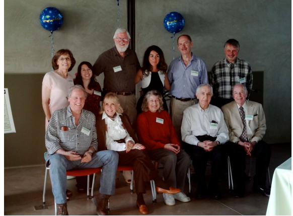
Current officers (standing) benefit from the experience of the Chairs Emeritus (seated).