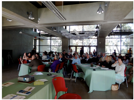
Everyone enjoyed the beautiful TreePeople Conference Center.