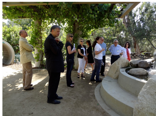
Guests enjoyed a guided tour of TreePeople.