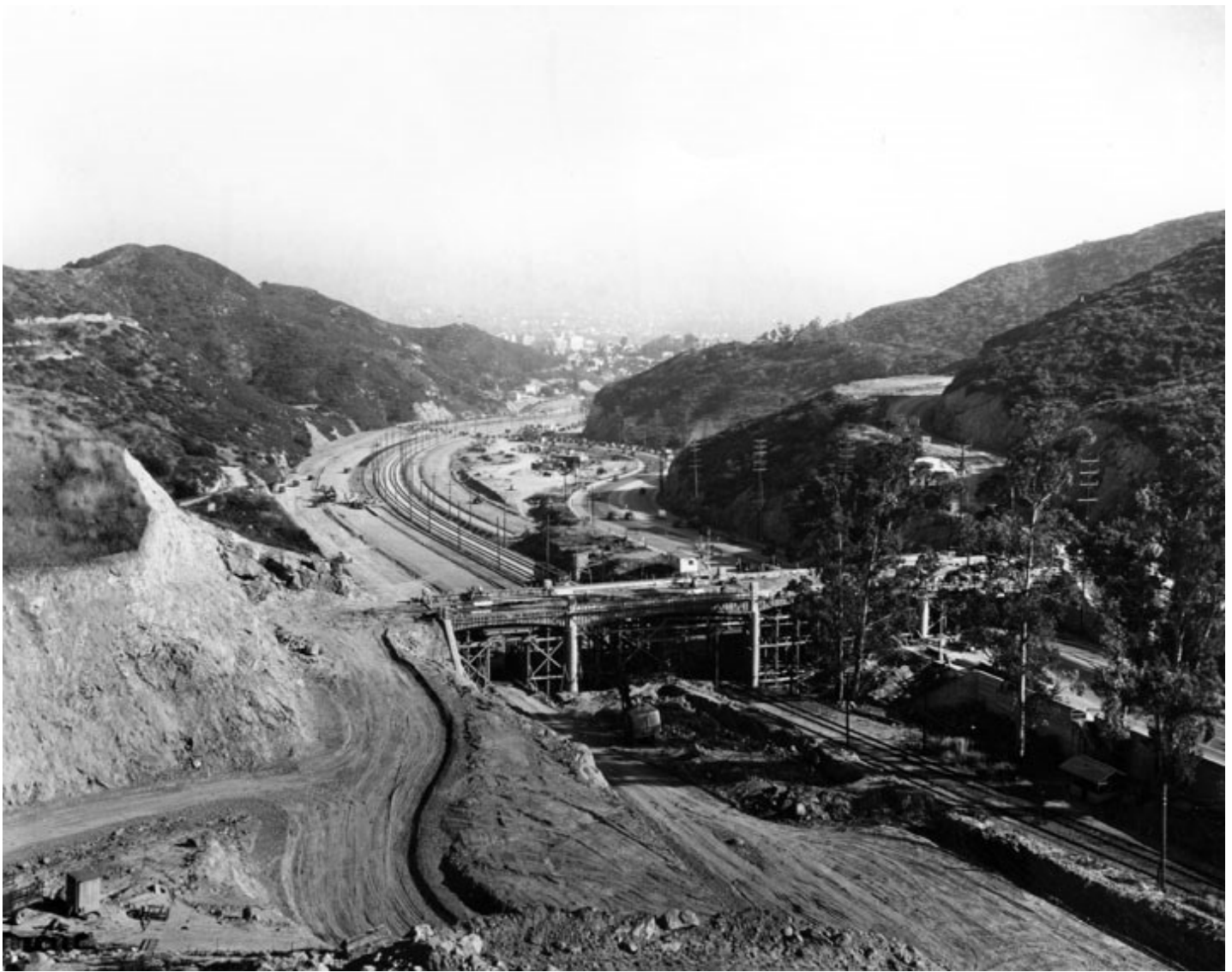
c. 1939 View of Cahuenga Pass looking towards Hollywood showing the construction of the Mulholland Drive Bridge.